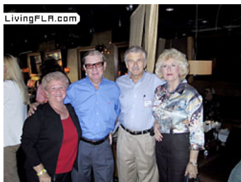
In July, we co-sponsored a GOP Business Networking at Delux in July. One of the first in Palm Beach County!